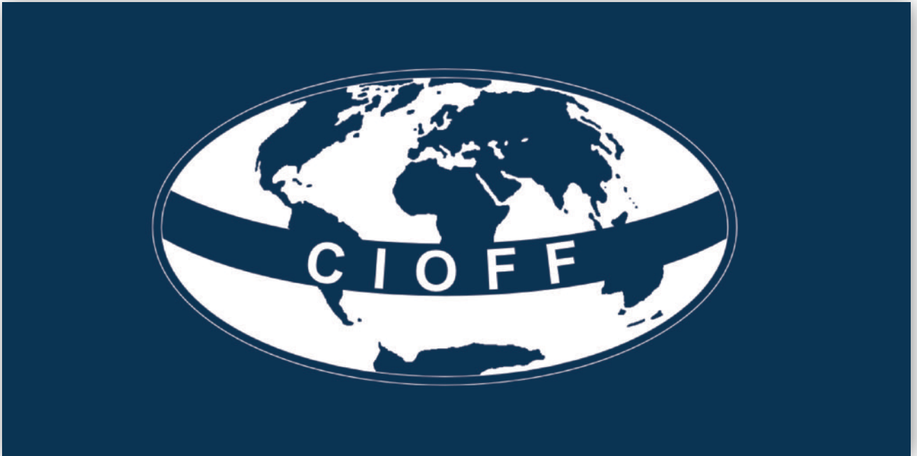
Flag Logo CIOFF® color background